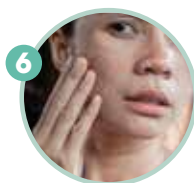
6 Poor skin condition, aging skin