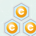
Bioflavonoids Vitamin C