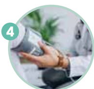
4 People with metabolic symptoms