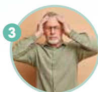
3 The infirm and the elderly