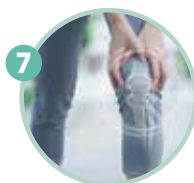
7 People with joint pain