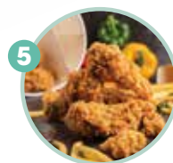
5 People who eat meat and less fruits and vegetables